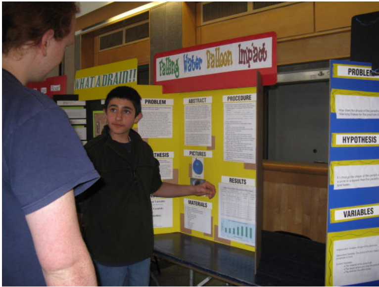
1 st Prize winner and judge