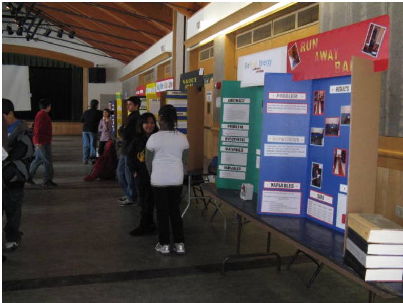
Fair Participants waiting to be judged