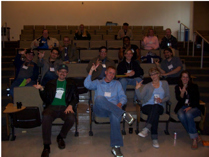
(above) Most of the attendees (below) the RHR