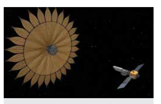
This artist's concept shows the geometry of a space telescope aligned with a starshade. The shade blocks starlight to reveal the presence of planets orbiting a star.