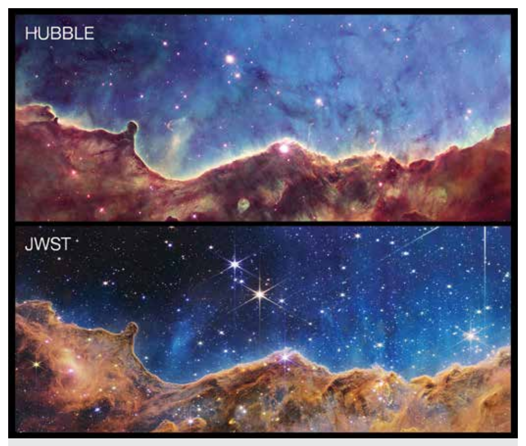
Top: This Hubble Space Telescope image, called Cosmic Cliffs, reveals part of the Carina Nebula (NGC 3372). Bottom: This image from the JWST, Hubble's successor, shows the same area. What will the next generation of telescopes reveal?

Learn more and sign up: <u>aip.org/starshade</u>.