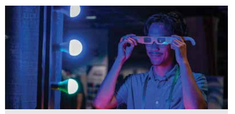
A student checks out the effects of diffraction glasses in the 2022 Physics Congress Exhibit Hall.

Linked but distinct, the societies of Sigma Pi Sigma and SPS are volunteer driven and donor supported. With your help we can ensure that future generations have experiences that mirror the comments of the students featured here. We each have a part to play in making the community more accessible and welcoming, and I invite you to join us in supporting the next generation and the next 100 years of Sigma Pi Sigma.