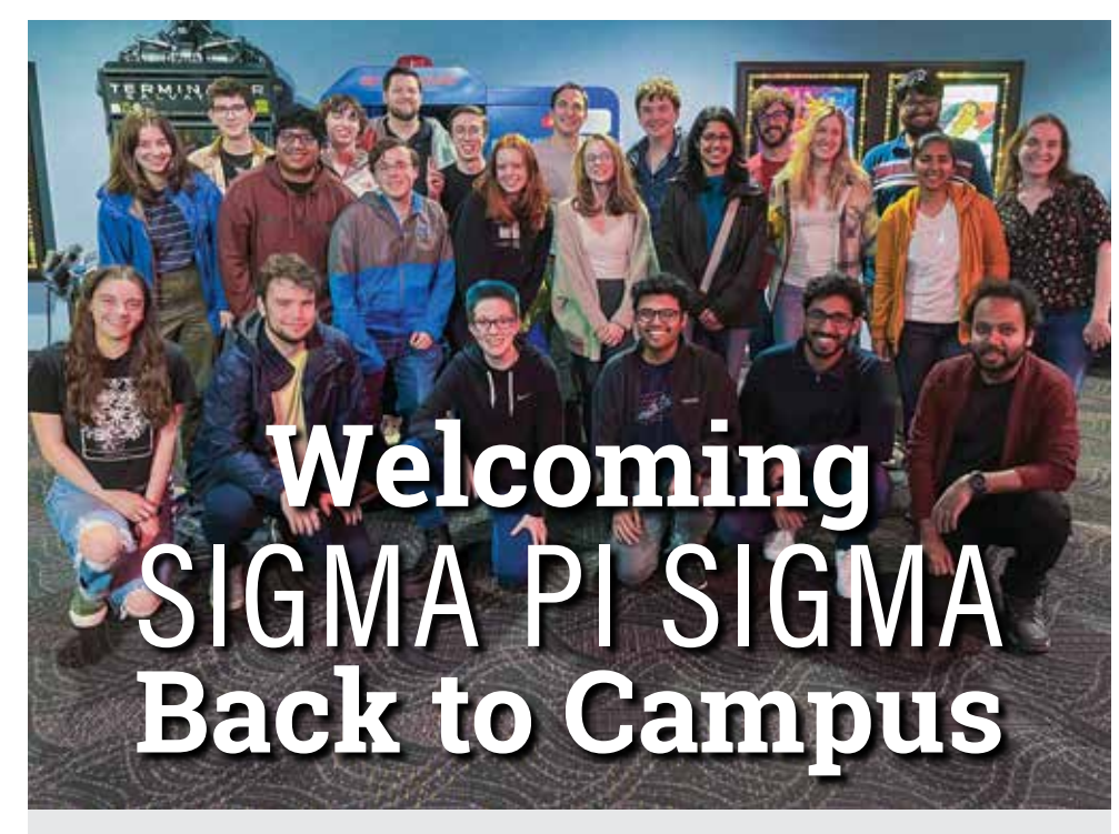
Clemson's SPS chapter and members of its graduate student association enjoy a fun night at the movies.