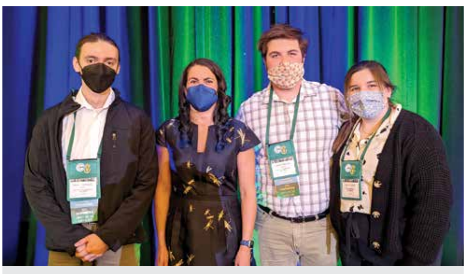
SPS reporters from Texas A&M University - Commerce commemorate their interview with Sarah Hörst (second from left).

SPS provides $300 in financial support for chapters to start food cabinets for hungry physics and astronomy students. Chapters use funds for items that are freely accessible to all department undergraduates and are encouraged to fundraise to restock and maintain the food cabinet. Applications are accepted on a rolling basis. For details see <u>spsnational.</u> org/scholarships/FFHPS.