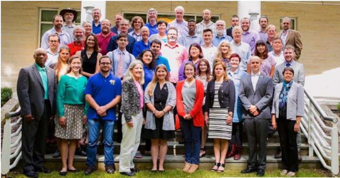
2017-2018 National Council