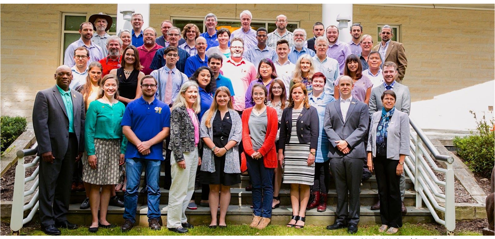
2017-18 National Council