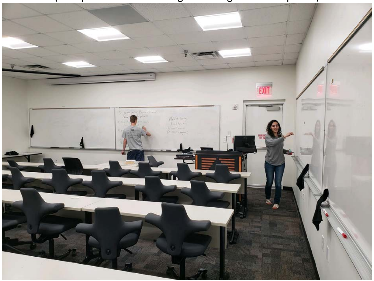
(Duo finding various scientists to solve a riddle)

(Group of students working out a magnetic chess puzzle)