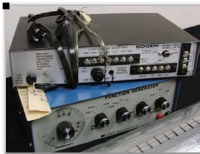
Gifts for the project