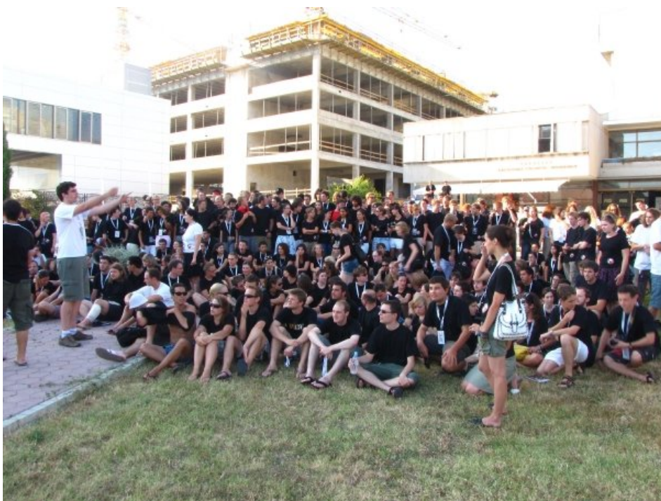
Group picture during last day of ICPS

As the conference came to an end, we were all sad to have to leave our newly developed friendships and return to our homes, back to study and work. I did come back with many invitations to return to Europe, which I hope to be able to visit again. Even though the trip was only about 10 days, I feel I developed great friendships, and I'm sure I'll see these people again. It is unfortunate that there is not much continuity with U.S. Students returning to ICPS. One of the things I noticed during my stay was that many people knew each other from previous visits, and the ones there for the first time were already making plans to return next year. I hope to be able to travel again next year and help increase the number of the U.S. contingent at Graz, in Austria, and relive the great memories from the 2009 ICPS in Split.