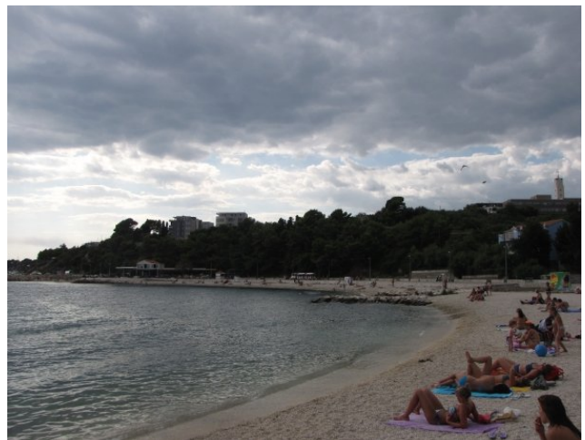
Beach near the dormitory

The amazing Split weather gave us plenty of opportunities to visit the beach during our free time, and even in the middle of the night! There was a nice beach just a ten minute walk from the dormitory. We