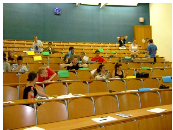
Annual General Meeting