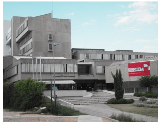
Building where the lectures were held

During the rest of our stay in Split, there were numerous more lectures covering all fields of physics.