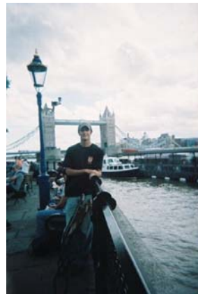
At the tower bridge.

I must admit the first day was a bit frustrating, self inflicted misery. Getting lost in a large city such as London is a fairly frightening ordeal. After things settled down, I decided to meet with some of the hosts. Throughout the entire program, the hosts were the greatest asset. Each day was obviously meticulously planned and scheduled to benefit the most out of the eight days in London. I can't say enough about them, some of the greatest friends I will ever have. The well organized student and professor presentations sparked my interests even further than before. Some of the student presentations were so well, it was difficult to distinguish professor from student research.