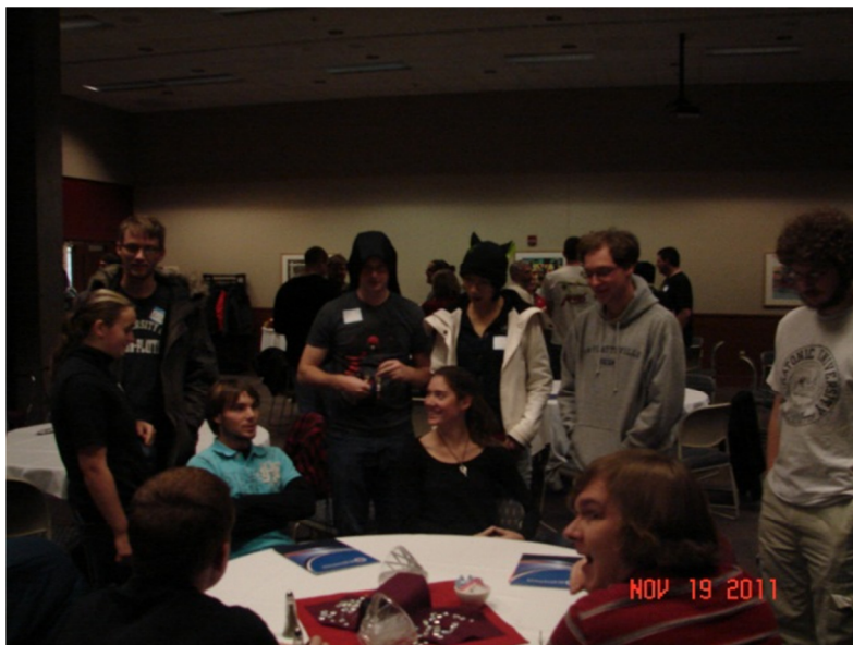
Figure 4. A group of students patiently awaiting dinner

Following the speaker roughly 50 people, including Michigan Tech, Platteville, Professors, Engineering Physics Alumni, guest lecturer, and the Zone 9 advisor enjoyed a thanksgiving banquet to close off the event.