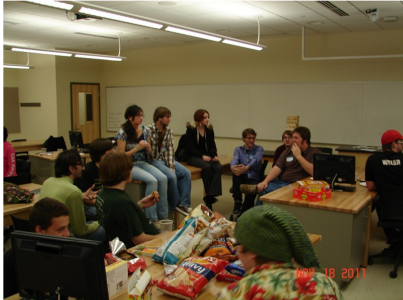
Figure 1. Gathering for introductions

The 2011 Zone 9 meeting was held at the University of Wisconsin Platteville, on November 18 th and 19 th . The attendees included 13 students from Michigan tech and roughly 10 students from Platteville for the first evenings events. We had introductions followed by chapter reports where we discussed different outreach