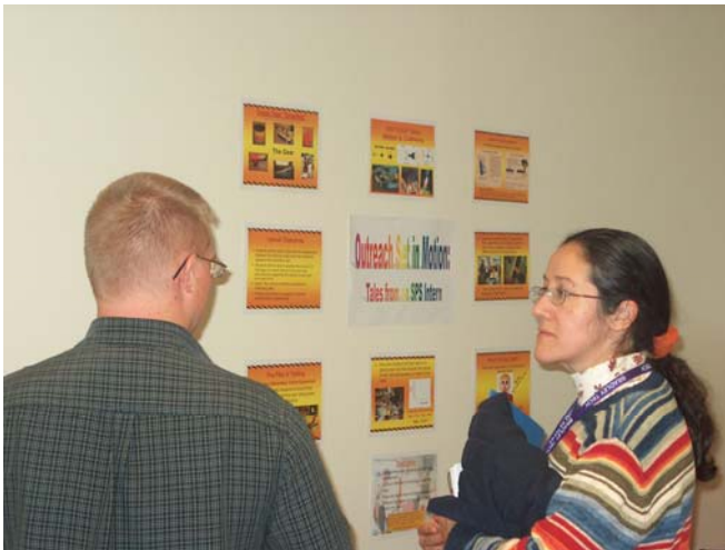
More from the Poster Presentation