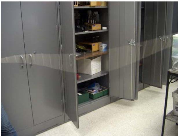
Sinusoidal Motion and Nodes