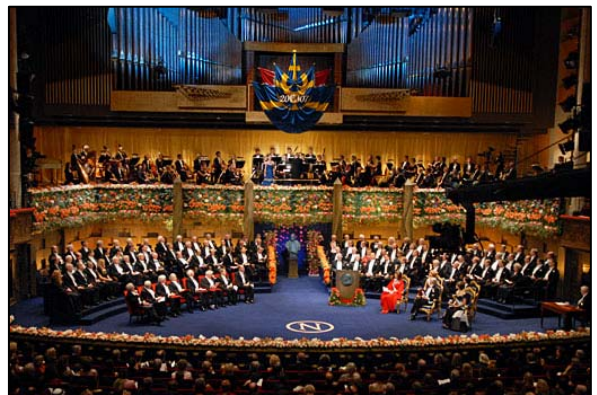
The 2007 Nobel Prize Award Ceremony begins.

After two days of poster sessions, oral sessions, press conferences, and dinners with good food and great company, I was beat. But the meeting carried on long after I left Wednesday morning, with sessions continuing through Friday afternoon. I was sad to miss a reception in honor of the Nobel Peace Prize-winning Intergovernmental Panel on Climate Change that took place on Thursday night ( http://nobelprize.org/nobel_prizes/peace/laureates/2007 ). I hear they even brought a medal to show off!